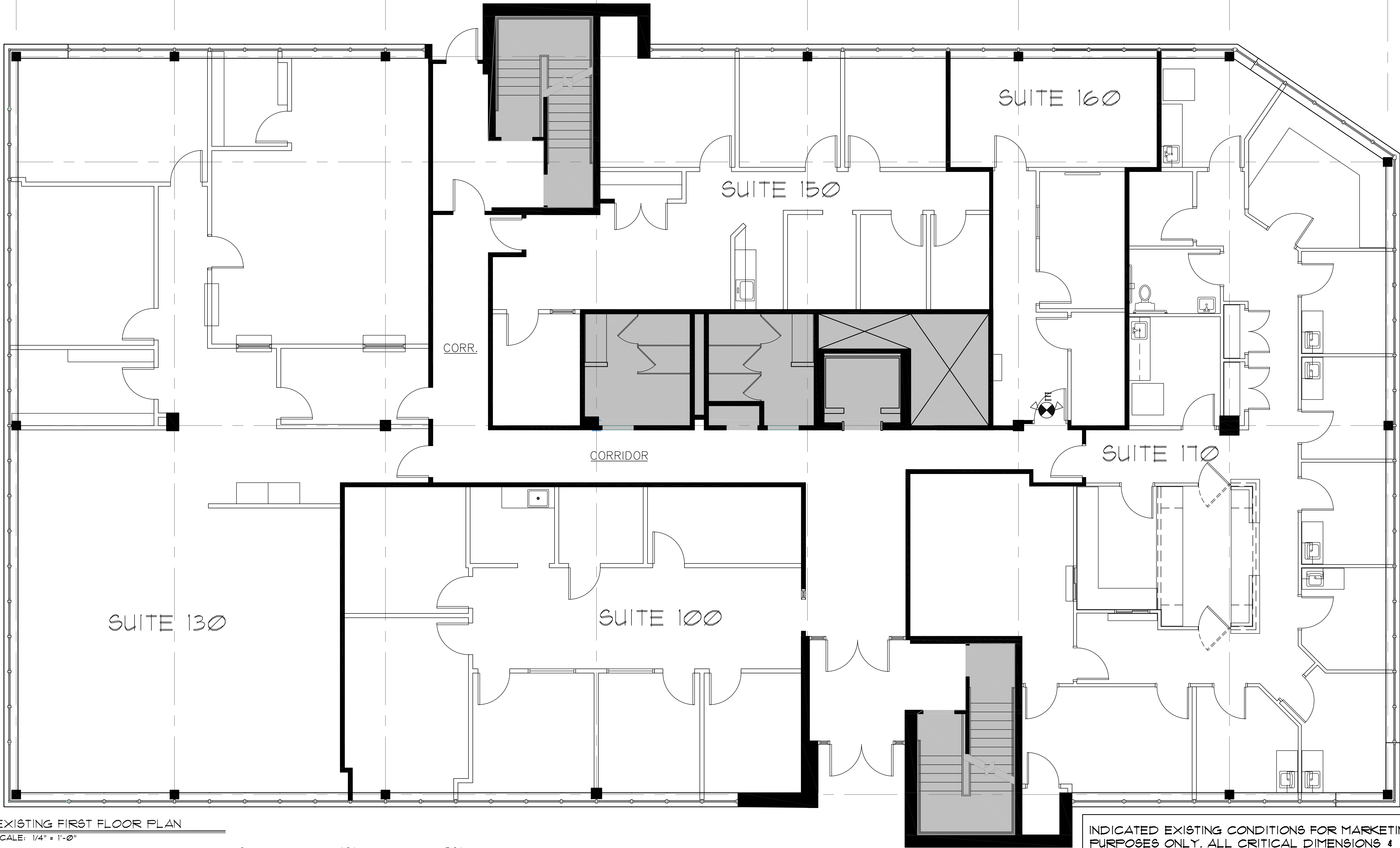
1 EXISTING FIRST FLOOR PLAN FP-11 SCALE: 1/4" = 1'-0"